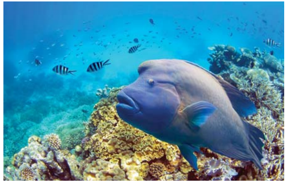
UNESCO says the reef is polluted and overdeveloped

Over the course of the last 30 years, the Great Barrier Reef – made up of 600 islands and 3,000 coral reefs – has lost 50 per cent of its coral. The region contributes around AU$6bn (US$4.6bn, €4.2bn, £3bn) to the Australian economy.