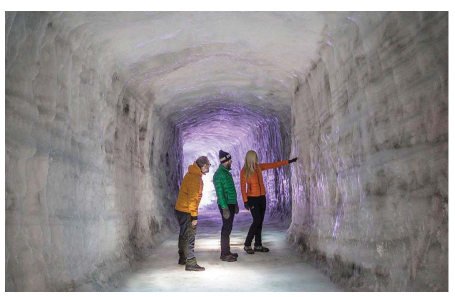
The network of man-made tunnels stretches back as far as 300m (984ft) into the solid ice

Visitors from across the world can now see blue ice. Each year, the ice cap is covered in roughly six metres of fresh snow, which on one side is compacted by the weight of the snow,