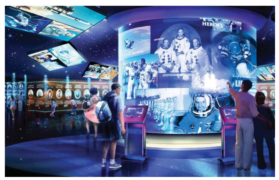
The attraction will culminate with an exhibit looking at the US Astronaut Hall of Fame

The highlight of the visitor attraction will be a 3D omnidirectional theatre, designed to make guests feel as though they are floating in space. Imagery shot in outer space will