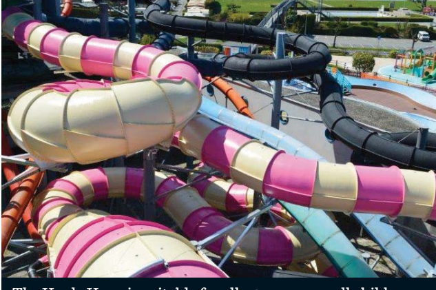
The Houla Hoop is suitable for all ages, even small children

The company also recently completed an installation at Singapore's Sports Hub.