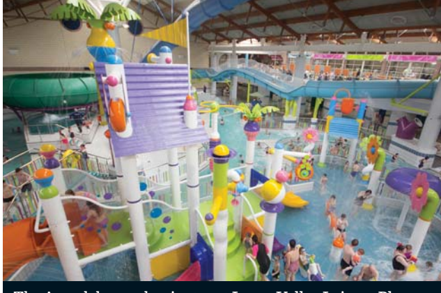
The Aquadek now dominates at Lagan Valley Leisure Plex