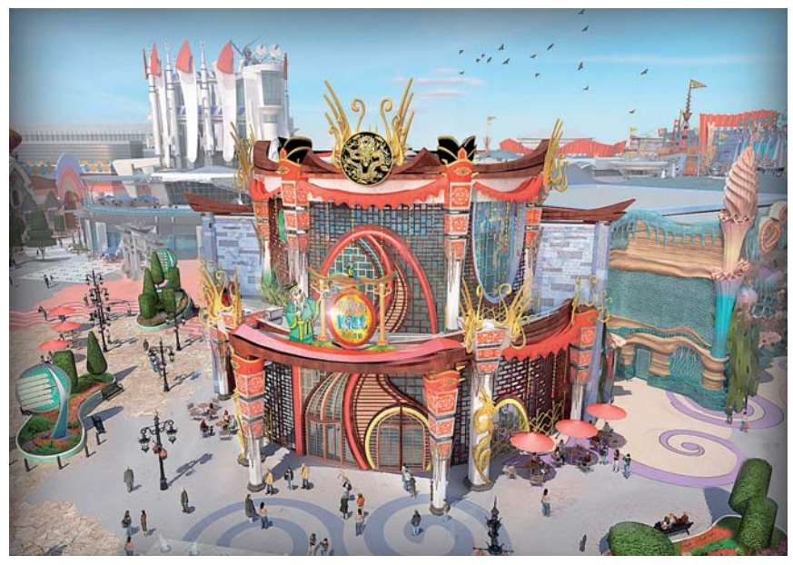
An attraction inspired by Chinese culture at "Fun Capital" theme park, Changping, China

"These mixed-use projects need both areas of knowledge," says Varnica. "There are traditional architecture practices and specialised firms for entertainment design, but none of them fill the needs of mixeduse leisure tourism projects. We realised