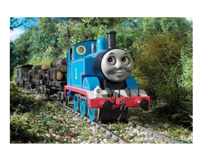
Thomas recently turned 70-years-old

The attraction will culminate with the US Astronaut Hall of Fame, allowing guests to look at the 100 astronauts inducted to date. More: http://lei.sr?a=W4N7T_A