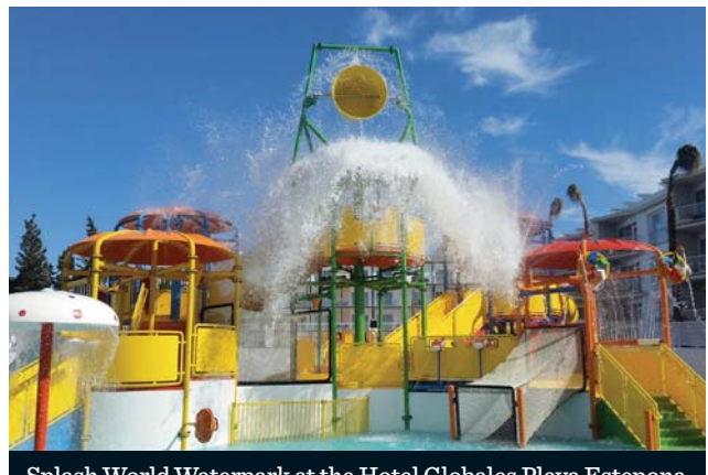
Splash World Waterpark at the Hotel Globales Playa Estepona

A smaller model, called SplashGolf Jr, has a lower price and fits more locations where space is limited.