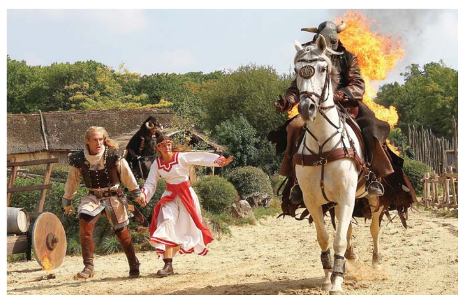
Puy Du Fou's unique style of live-action entertainment is coming to the UK in 2016

Modelled on the success of the not-for-profit Puy du Fou historical theme