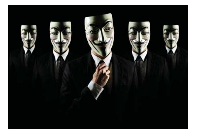
Anonymous had criticised Japan over its whaling activity

JAZA said in a statement that the network of hackers and activists managed to infiltrate two JAZA websites, retrieve member-only information and publish the data online. In response, the body temporarily shut down the websites affected by the security breach.