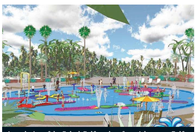
A rendering of the SplashGolf product from Adventure Golf

The project posed a unique design and installation challenge of fitting a large amount of new fiberglass into a tangle of waterslide flumes, according to WhiteWater. The company developed a detailed 3D environment of the site that allowed it "to minimise any potential interference with the existing structural supports and waterslides".