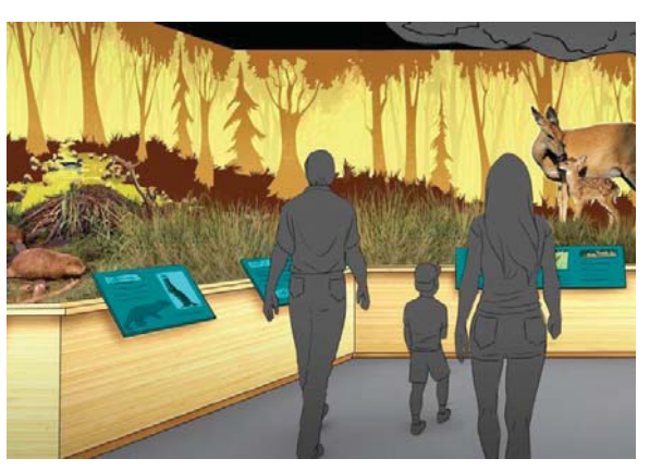
Fuqua & Partners Architects designed the museum

New live exhibits will include a saltwater