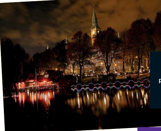
Almost 11,000 attendees came to last year's Euro Attractions Show in Amsterdam, the Netherlands