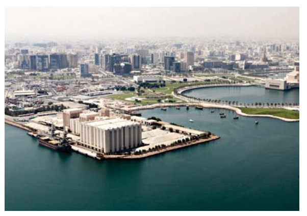
The gallery is sited on Doha's cultural and historic waterfront

The gallery is sited on Doha's cultural and historic waterfront, next to I.M. Pei's