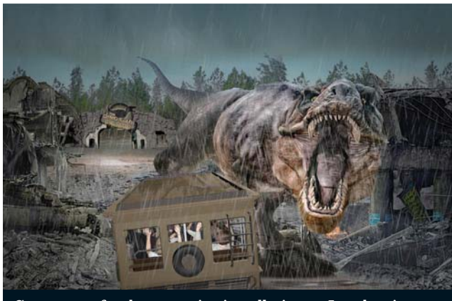
Concept art for the upcoming installation on Langkawi