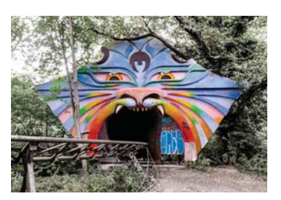
Spreepark first opened in 1969

Once operating under a full calendar, visitors can embark on the weather-dependent adventure between March and October. More: http://lei.sr?a=V9S2b_A