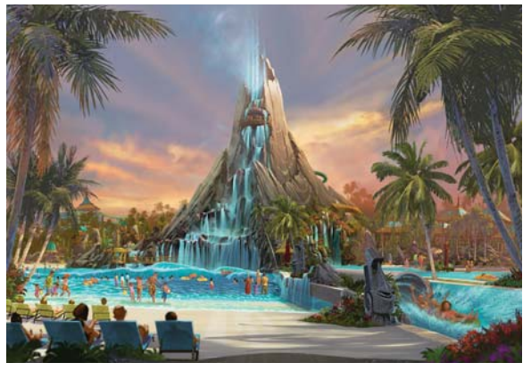
The new waterpark is scheduled for opening in 2017

According to a statement released by Universal, the attraction will be highly themed, with a completely immersive environment inspired by tropical islands. Volcano Bay will complement Universal's existing Cabana Bay Beach