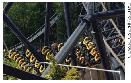
16 people were on the ride when it crashed

The Smiler is subject to a legal prohibition notice until action is taken to deal with the cause of the crash. In addition to the Smiler, Merlin has temporarily closed Thorpe Park's Saw and Chessington World of Adventures' Dragon's Fury and Rattlesnake rides. Spinball – also at Alton Towers – is shut until enhanced safety protocols have been implemented.